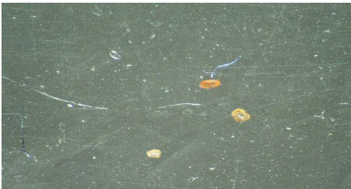
Fig 2. Photo record of the sample of separated Monazite mineral grains

A digital photo of part of the surface of the film with separated monazite grains of 50 – 100 micron in size placed thereon taken at 60x magnification is given in Fig 2. The micro EDXRF spectrum obtained from the above sample is illustrated in Fig 3. The measurement conditions are listed in Table-1.