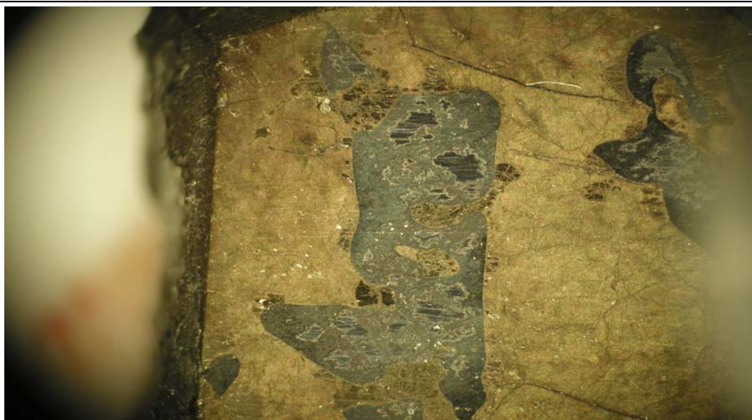
Fig 2. Digital Picture of Chalcopyrite sample at 15X magnification