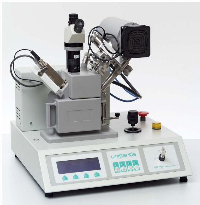
Unisantis XMF-104 X-Ray Micro Analyser

Such a study was possible due to the high resolution of Unisantis XMF-104 X-ray Micro Analyser which allows precise characterization of various elemental components of mineral grains of very small size. In addition, XMF-104 uses a Polycapillary focusing lens which provides the analyst an intensely focused x-ray beam of very small diameter which is very essential for such geo-prospecting studies.