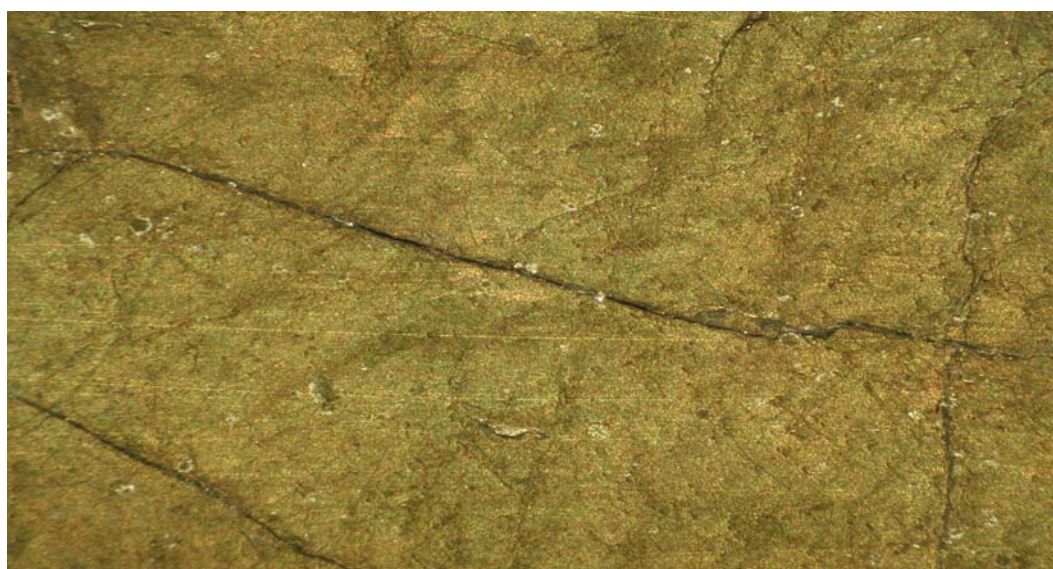
Fig 3. Digital Picture of Chalcopyrite sample at 60X magnification